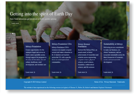
Infosys Corporate Social Responsibility Microsite